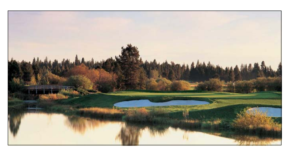
Access to the Crosswater and Caldera Links golf courses on site! Access to the Sage Springs Club and Spa.

Gather some friends and rent a Resort house so you can cook and party together! Get your groceries on site at the Sunriver Country Store, a full service grocery store in the Village.